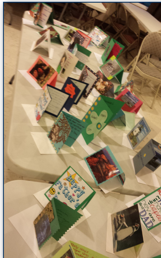
A total of 60 Father's Day cards were made.